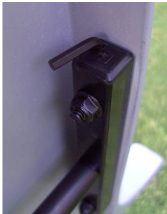
Spare Allen Wrench Stowage

In most applications, the objective of the rotation angle adjustment is to make the wing lift pin sockets align to the fuselage lift pins. Note that it may be preferable to error on the side of slightly excess rotation allowance; this reduces the possibility of undesired limiting if the ground terrain under the Wing Rigger happens to be uneven. During assembly, the normal practice is that the user can slightly raise the wing's trailing edge, if need be, to line up the glider's pins as the wing is pushed home.